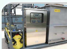
Hotels and Restaurants